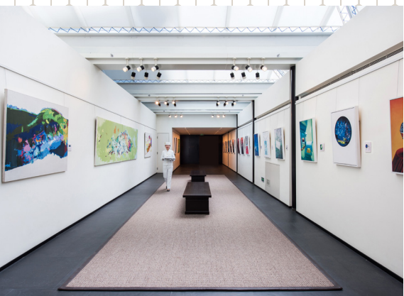
The Peninsula Gallery

The Peninsula Beijing's private art gallery hosts exhibits by an array of preeminent contemporary artists, as well as works created by the hotel's Artist in Residence programme that provides local artists with accommodation and gallery space to support their artistic creation. These works provide a stylish backdrop for exclusive receptions and special events, and allow guests to learn about the fascinating world of Chinese modern art.