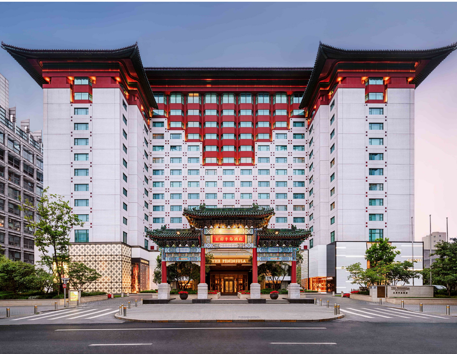
Exterior of The Peninsula Beijing