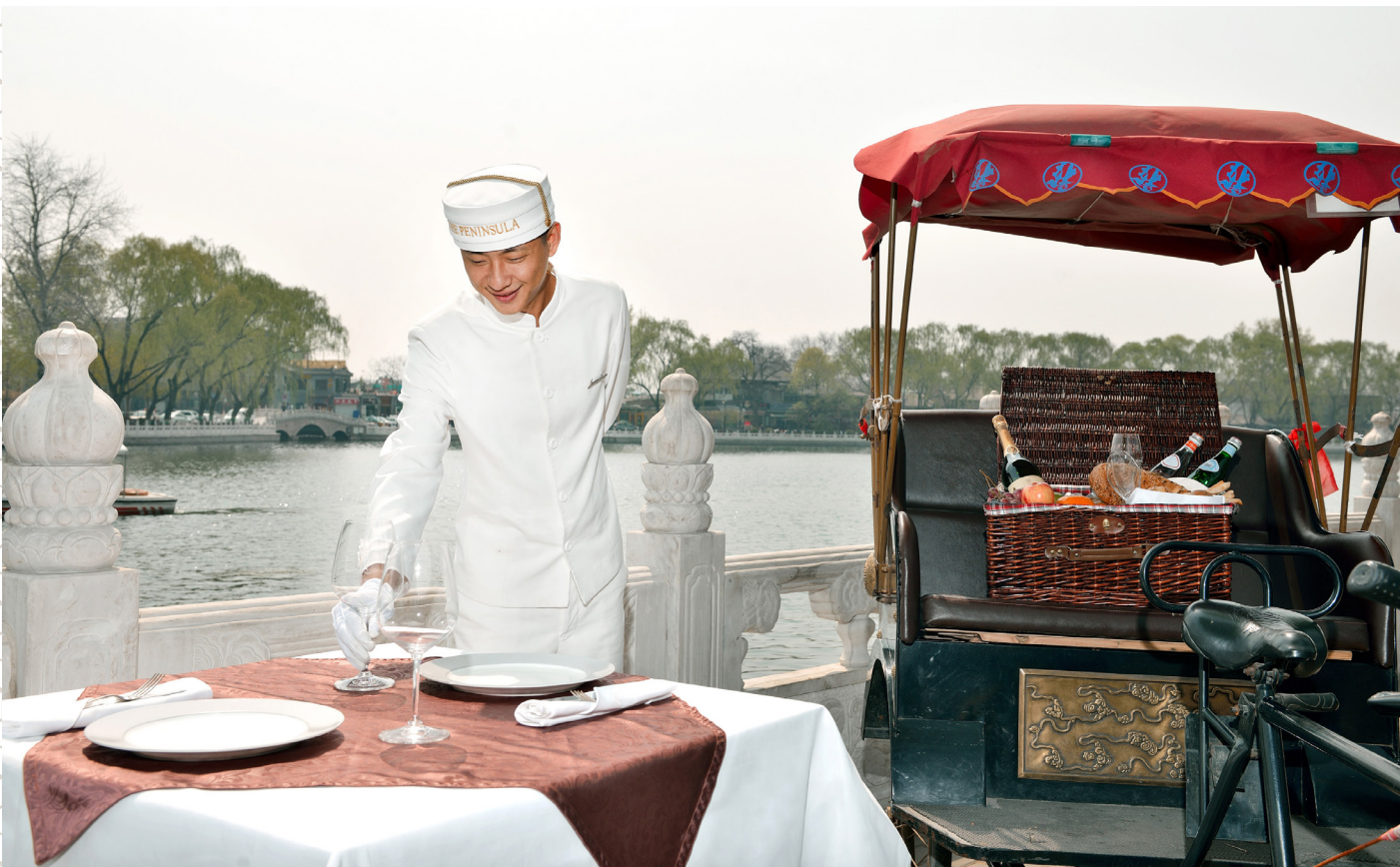
Hutong Tour – A Walk Through Beijing's Past