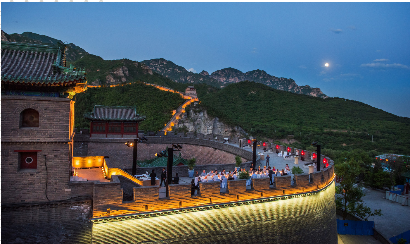
Event at The Great Wall

The Peninsula Beijing is a leader in bespoke catering. The hotel's skilled chefs craft inventive menus to delight guests at business functions and incentives events hosted at iconic locations, including the Great Wall, Forbidden City and the Summer Palace.