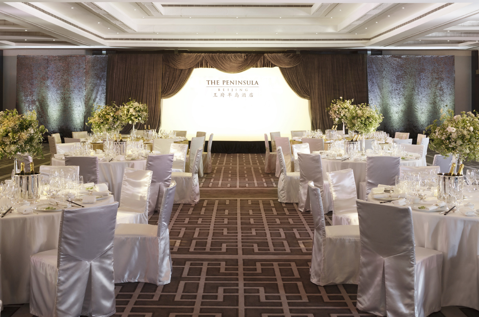
Wang Fu Ballroom