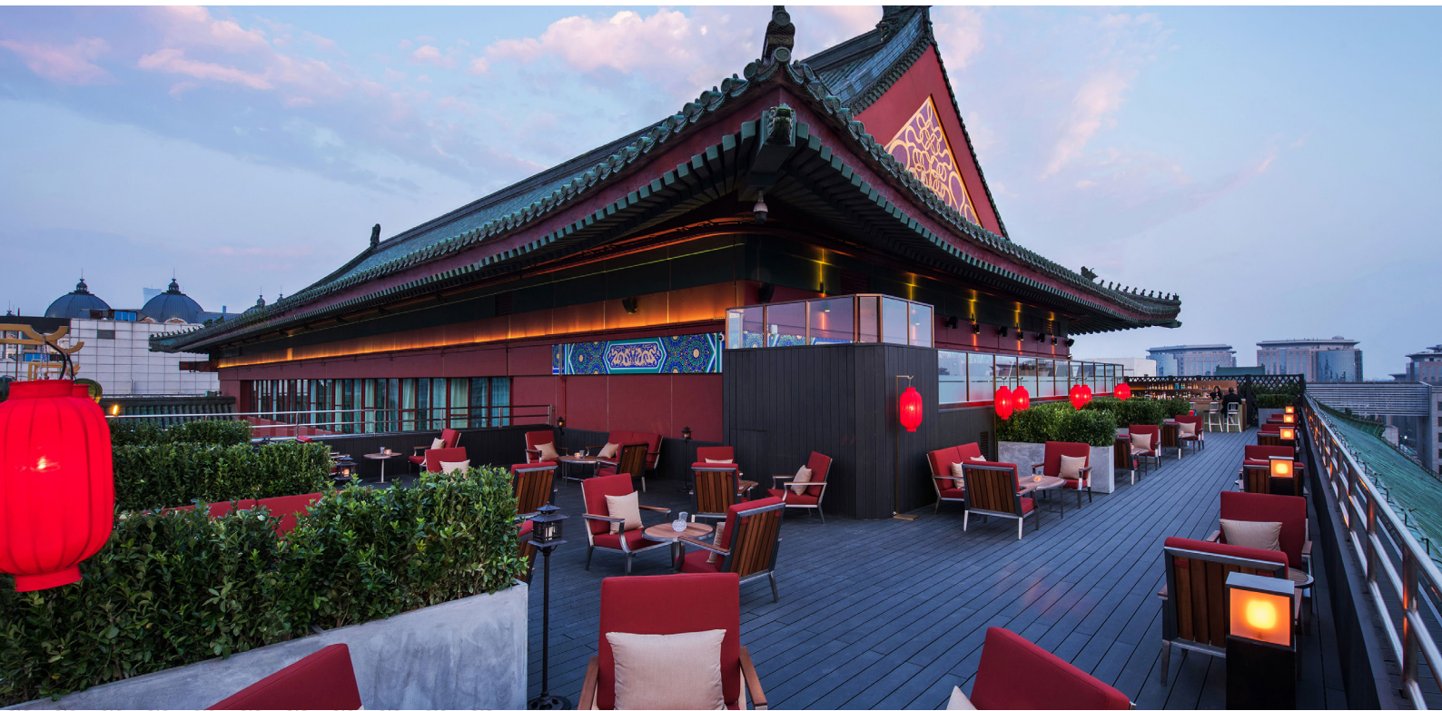
The Peninsula Yun