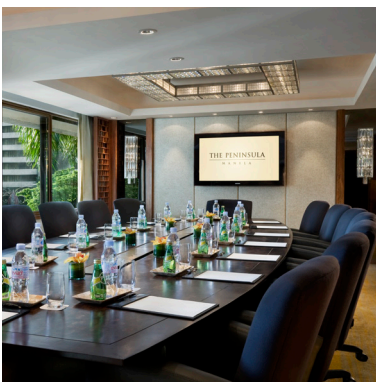
P.L. Lim Boardroom