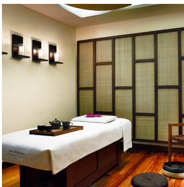
The Peninsula Spa Treatment Room