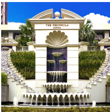
The Grand Fountain