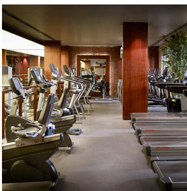
The Peninsula Fitness Center