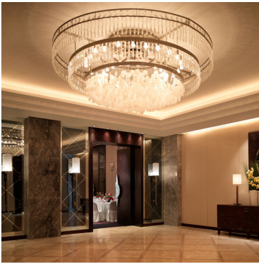
Rigodon Ballroom Foyer